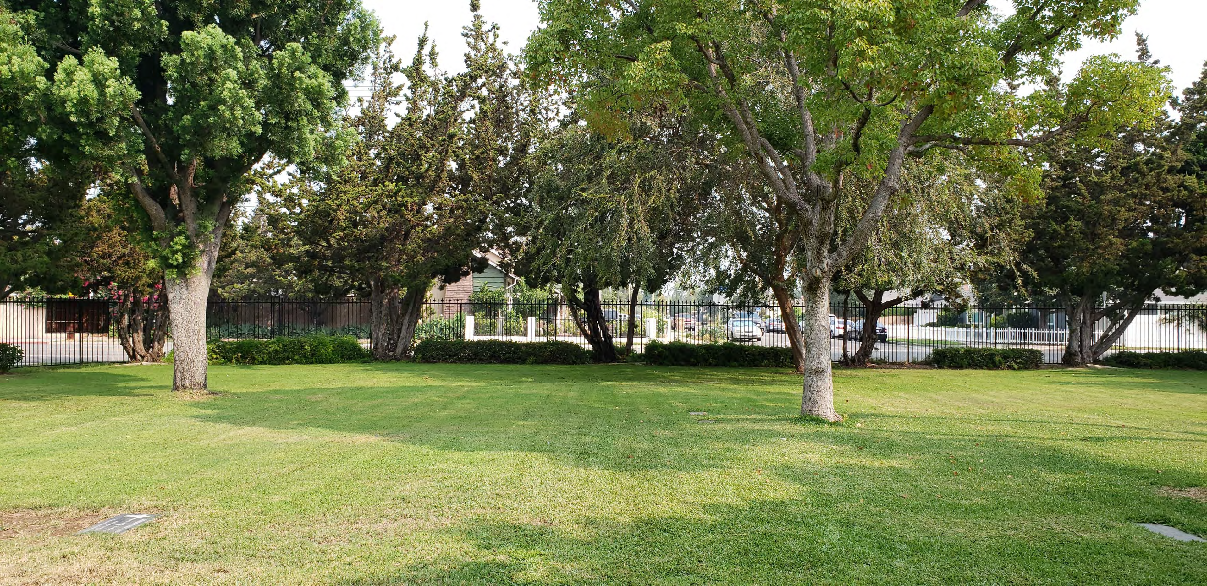
North-East Front 45