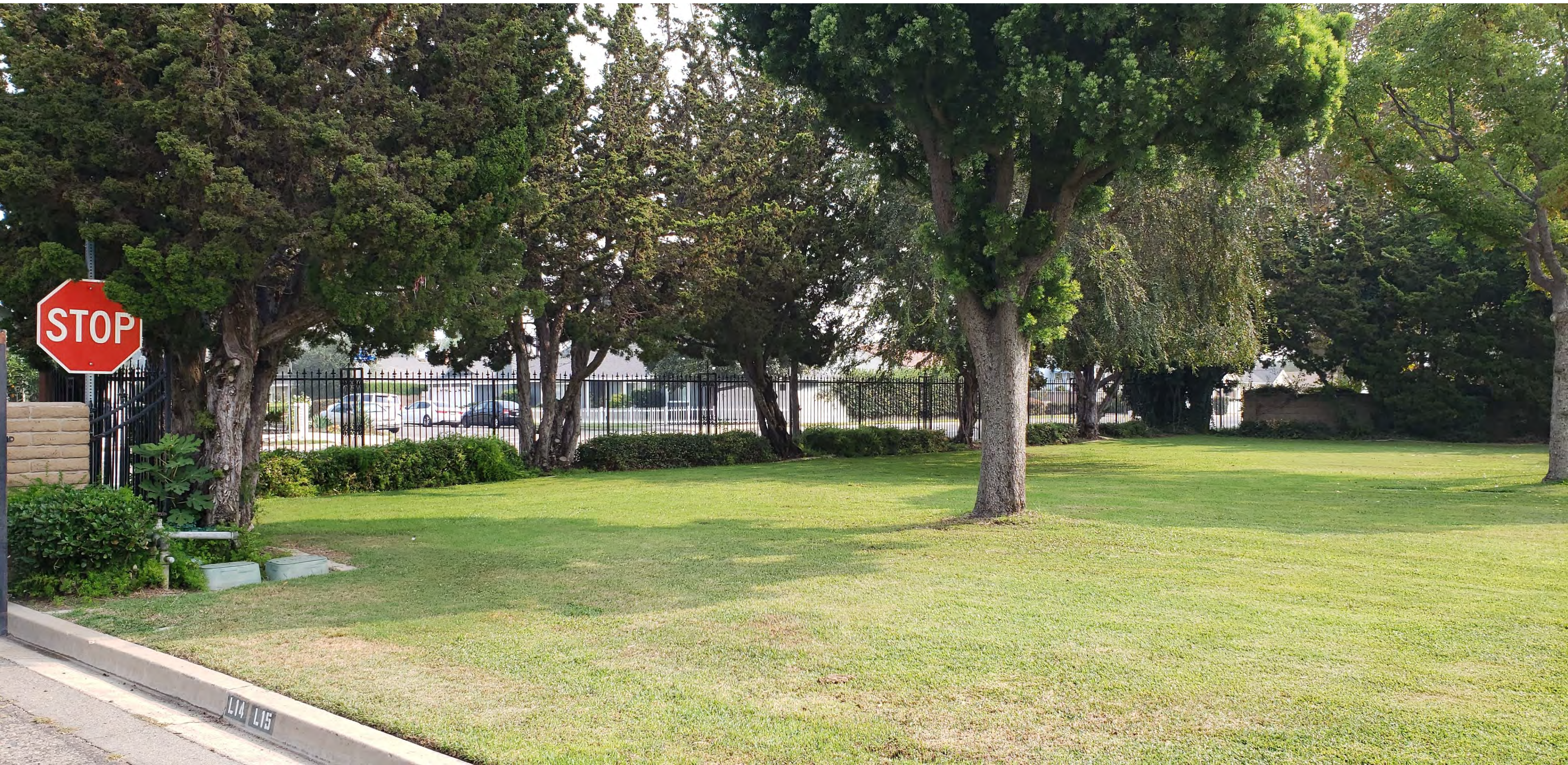
North-East Corner 44