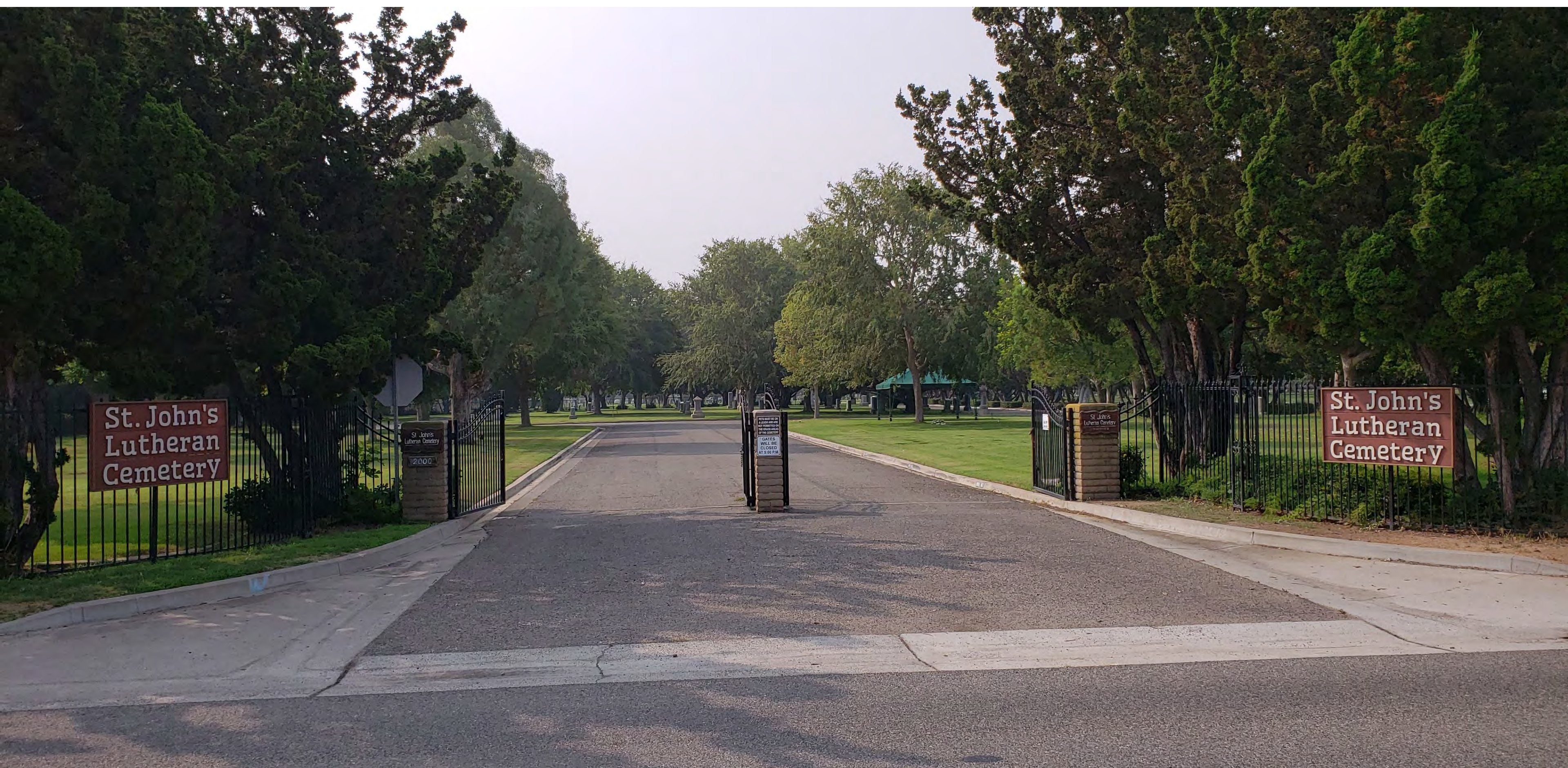
Front Entrance 42